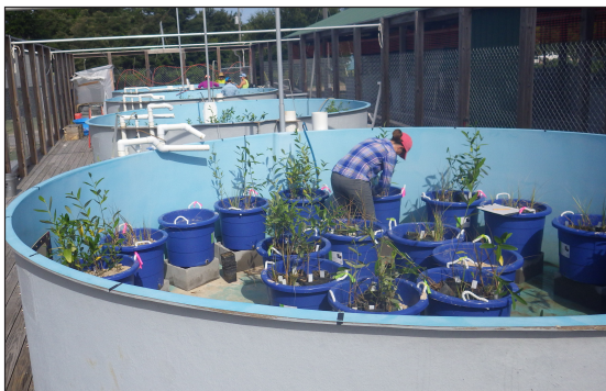
Preparation for the experiment at the Sea Lab's mesocosm facility.